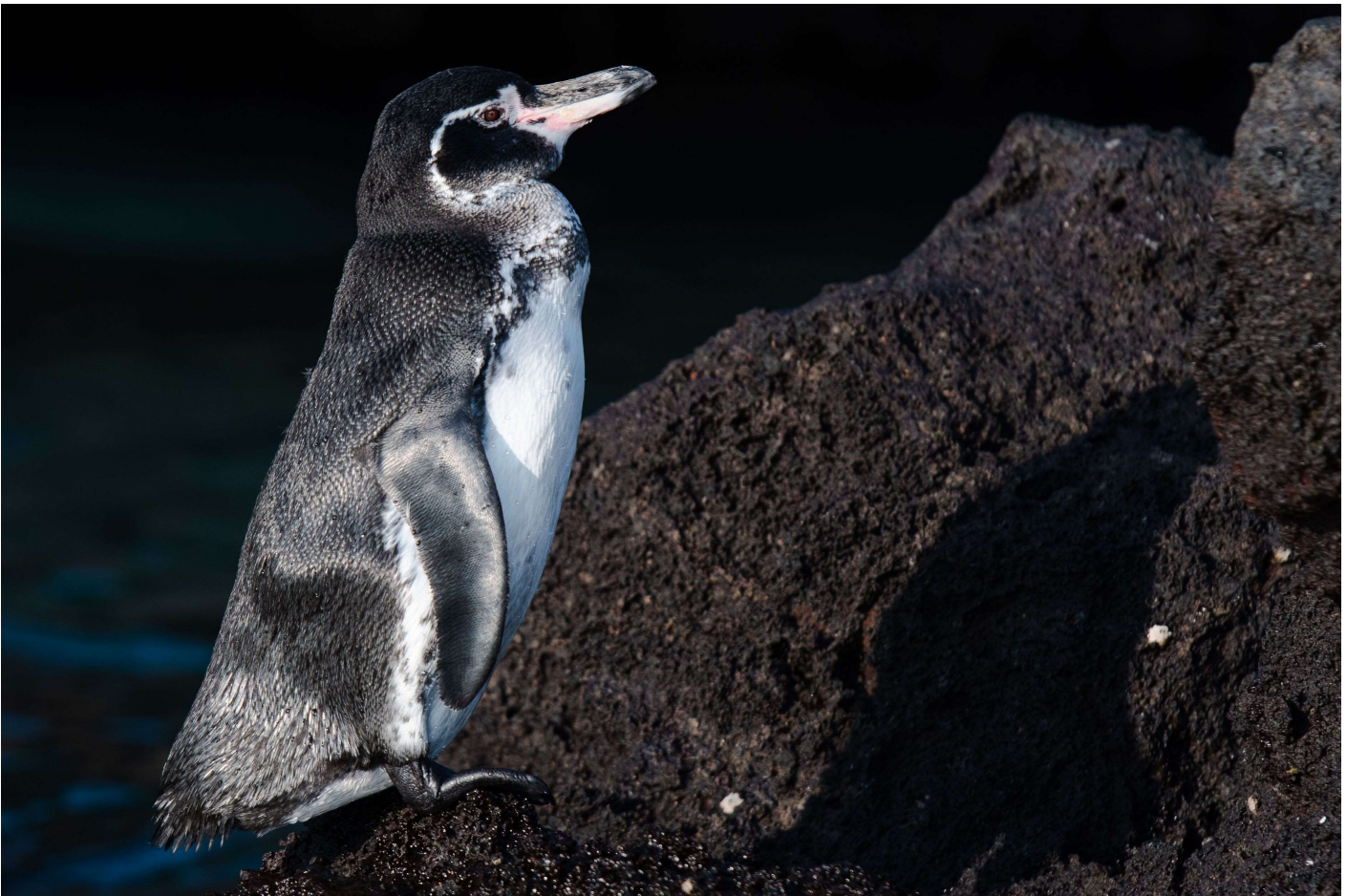
A Galapagos penguin drying its feathers in the afternoon sun.

Today we visited the incredible islets of Bartolomé and Sombrero Chino. These visitors' sites gave us the most amazing snorkeling opportunities and the chance to see one of the most charismatic animals of the Galapagos, the Galapagos penguin.