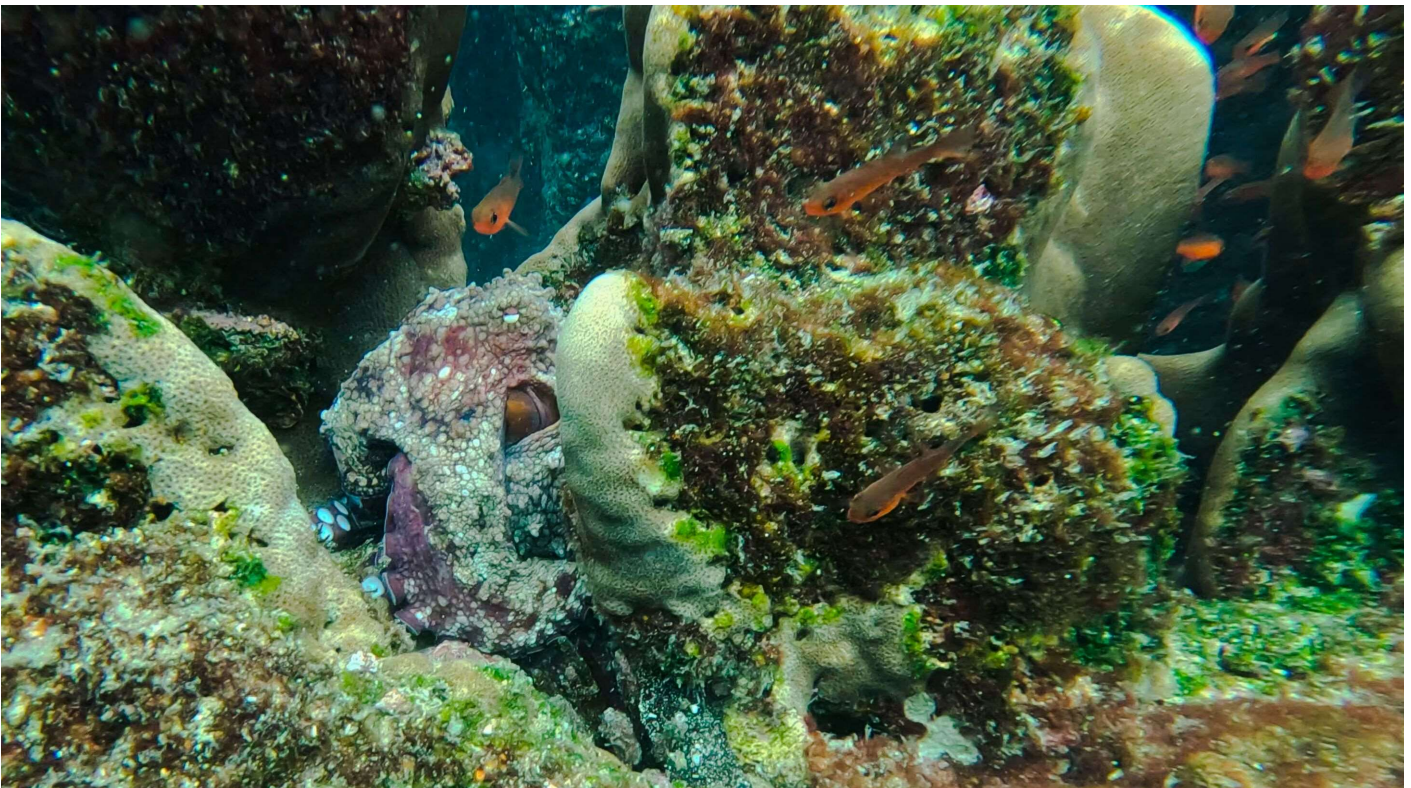
Finding an octopus is always a mesmerizing encounter. This one was very comfortable around us, even letting us get close enough to photograph it as it changed color slightly.