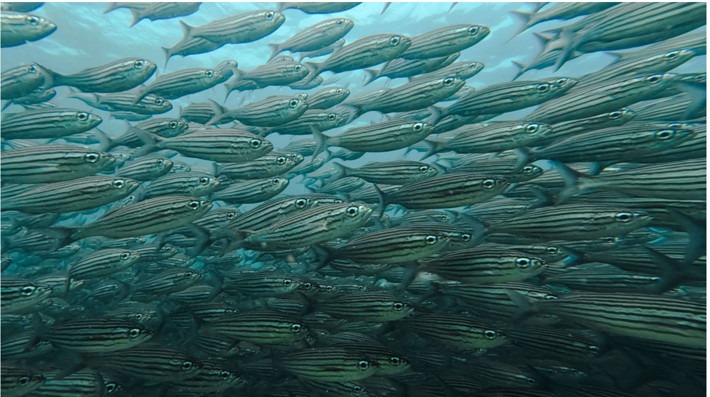
More black-striped salemas! They were everywhere!