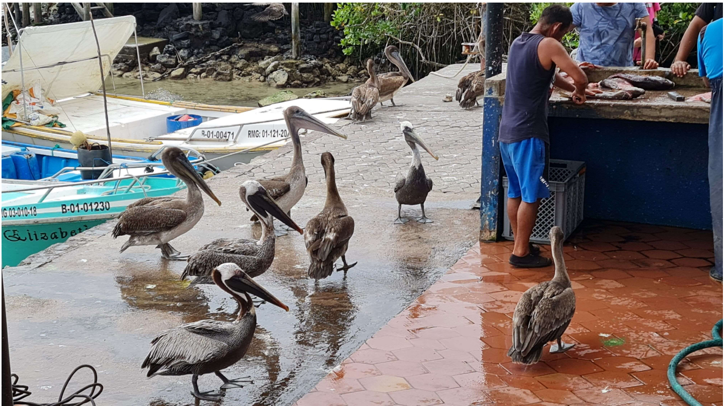
At the fishermen's market, brown pelicans wait for a piece of fresh fish.