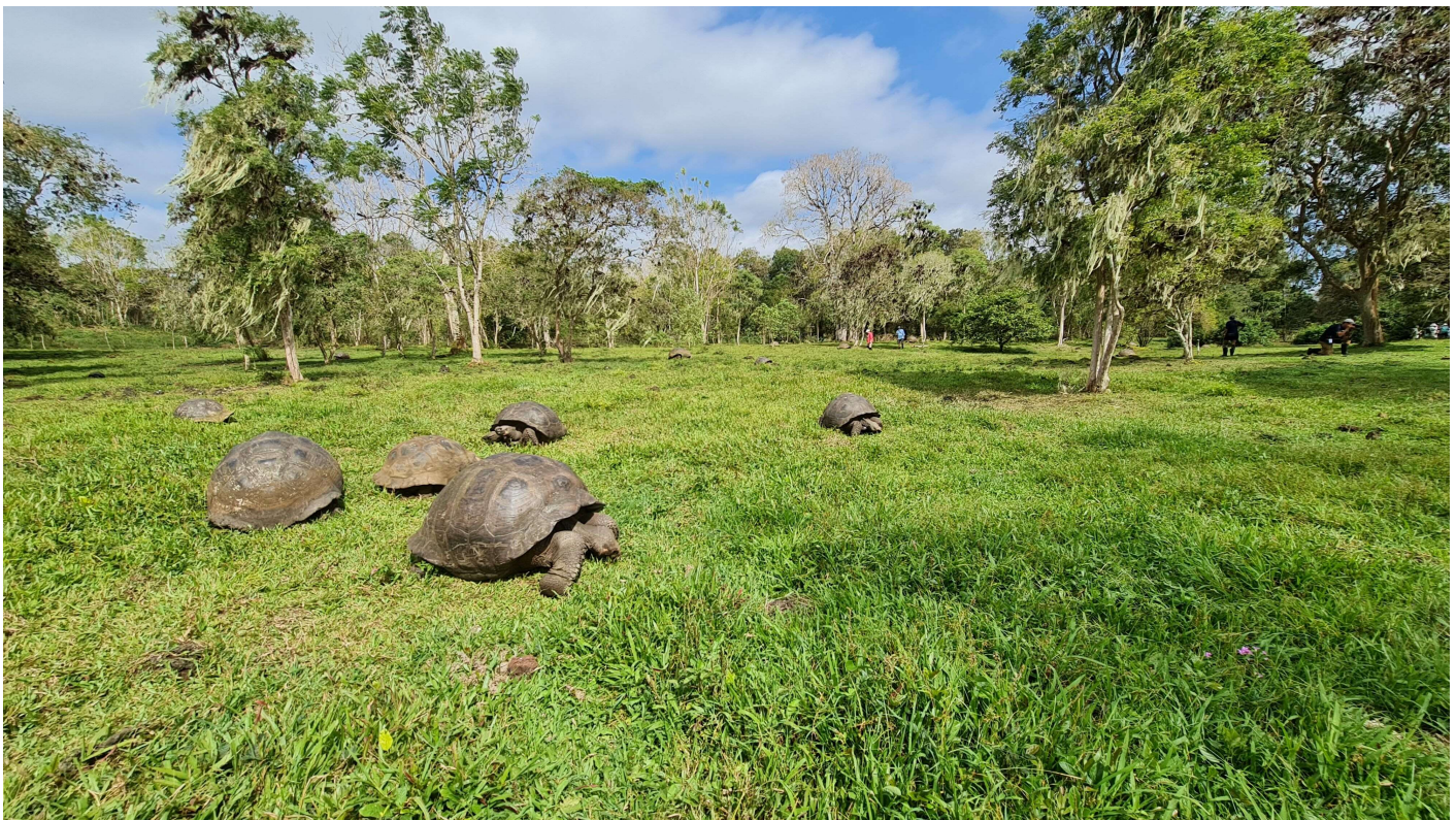
At the highlands of Santa Cruz, we found several giant tortoises feeding on grasses.