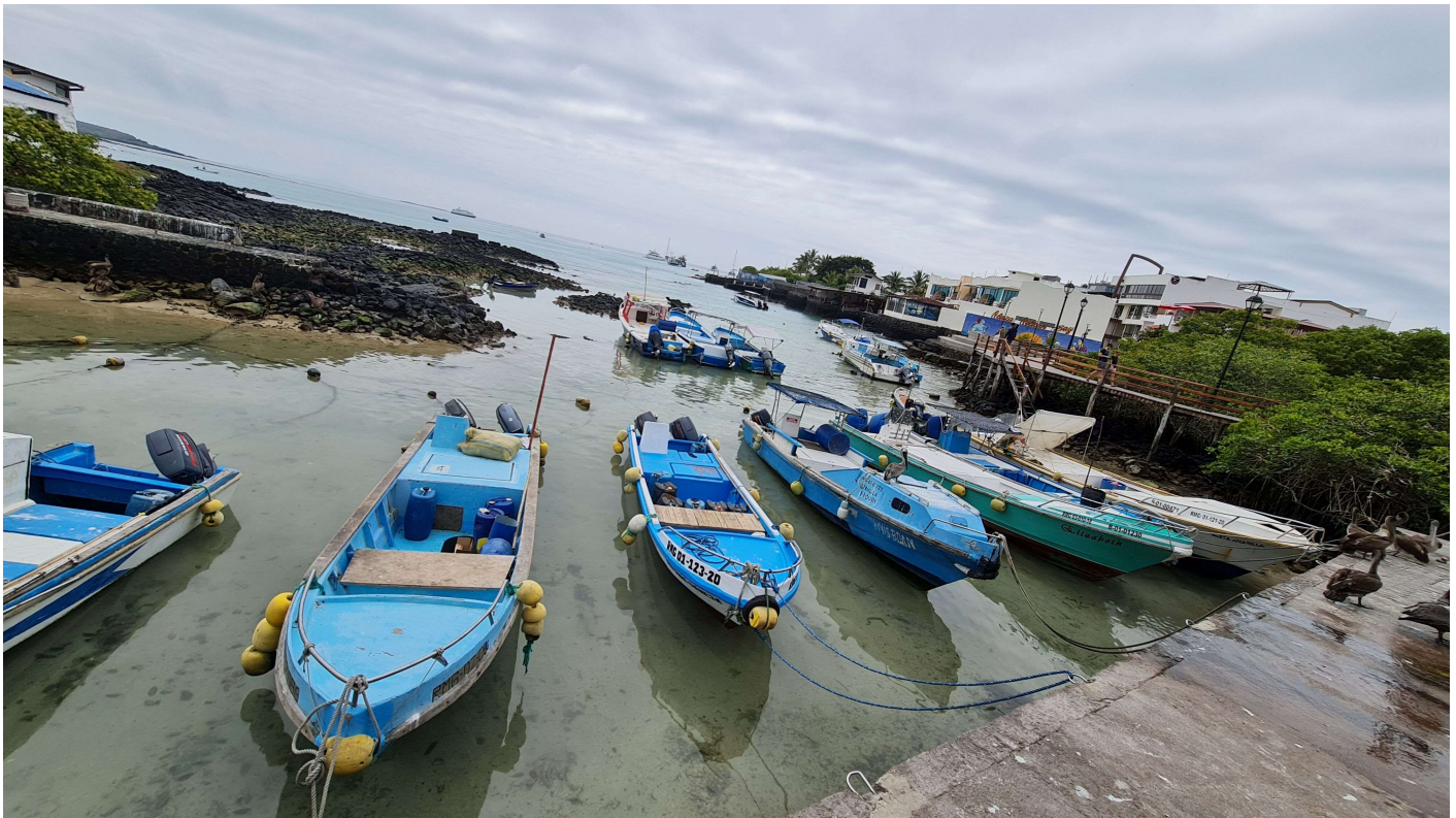
Local fishermen use these small boats to fish. Late in the afternoon, they bring their catches to sell at the fishermen's market.