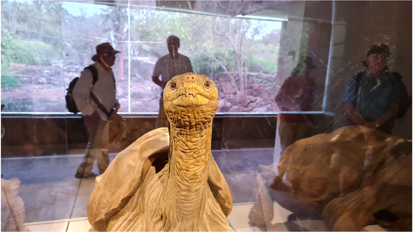
Lonesome George was the last pure tortoise from Pinta Island. He died in 2012, and taxidermists did a great job preserving his body.

Dec 13, 2022 - National Geographic Endeavour II